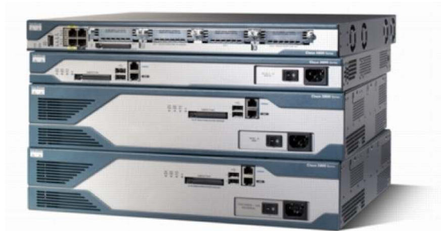
Figure 1. Cisco 2800 Series

Cisco Systems ® , Inc. is redefining best-in-class enterprise and small- to- midsize business routing with a new line of integrated services routers that are optimized for the secure, wire-speed delivery of concurrent data, voice, video, and wireless services. Founded on 20 years of leadership and innovation, the Cisco ® 2800 Series of integrated services routers (refer to Figure 1) intelligently embed data, security, voice, and wireless services into a single, resilient system for fast, scalable delivery of mission-critical business applications. The unique integrated systems architecture of the Cisco 2800 Series delivers maximum business agility and investment protection.